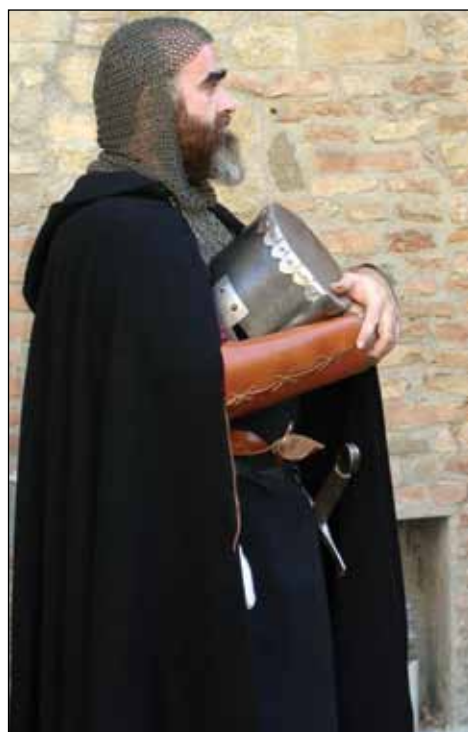
Entertainment will include duels, flag throwers and crossbow tournaments.