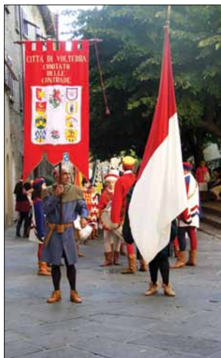
Community members are invited to attend the festivities Aug. 15 and 22.