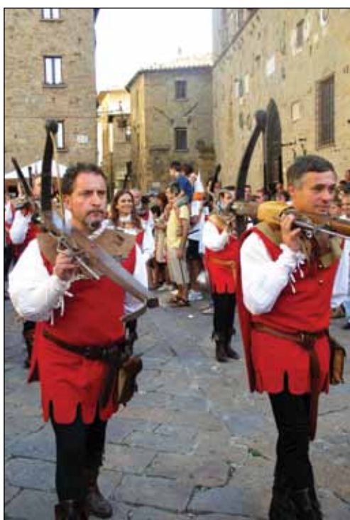
Artisan re-enactors walk the cobblestone streets in authentic costume.